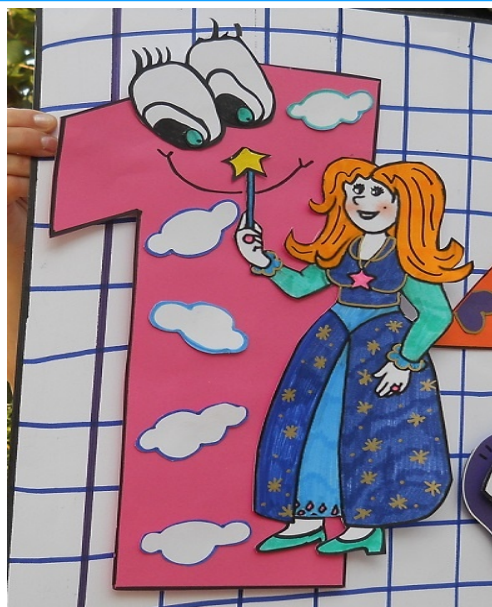
I per INCANTESIMO